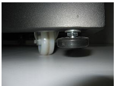
Castor Wheels and Leveling Feet