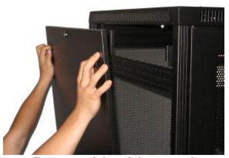
Removable side panel