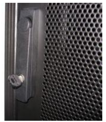
Lockable Perforated Door