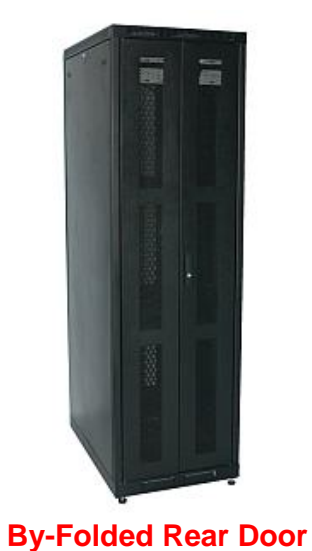
Standard Single Door Rack Doors Less Clearance needed to open By-folded Door Compared to a Standard Single door